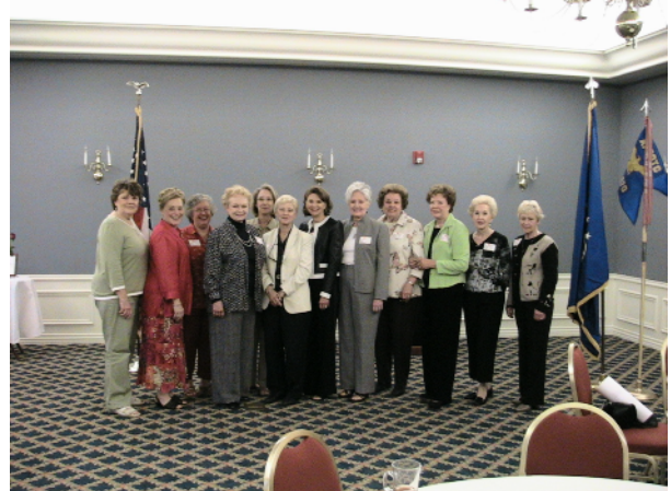
Right: Angel Flight alumni members from University of Nebraska at Omaha, 1951-1970's.