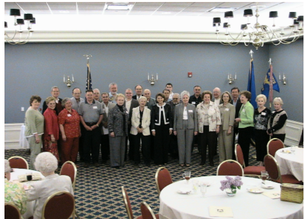
Angel Flight and Arnold Air Society alumni members gather for Det. 470 reunion.

The picture of the men and women together are the Det. 470 Alumni from 1951 and years after.